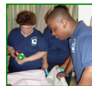
Ringers lead prayer during a nursing home visit