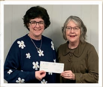
Living Word Community Church